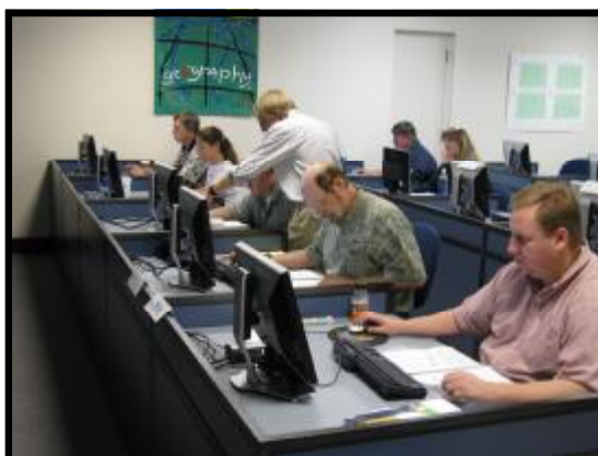
Left: Participants at the GIS Training Course