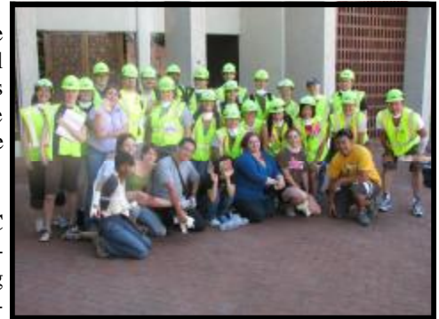
Left: Two DU students with their CERT gear Above: DU Students at the Final CERT Exercise